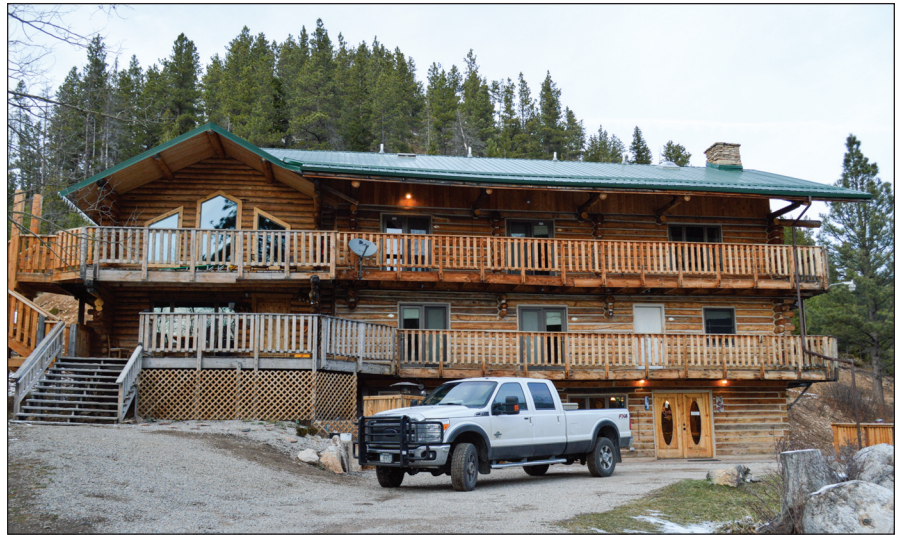
Judith Mountain Lodge is located eight miles outside of Lewistown. It has 10 hotel rooms, a restaurant with a full bar and a conference room.

Open every Thursday, Friday and Saturday evening, Judith Mountain Lodge’s restaurant features sirloin, salmon, shrimp scampi and other nightly